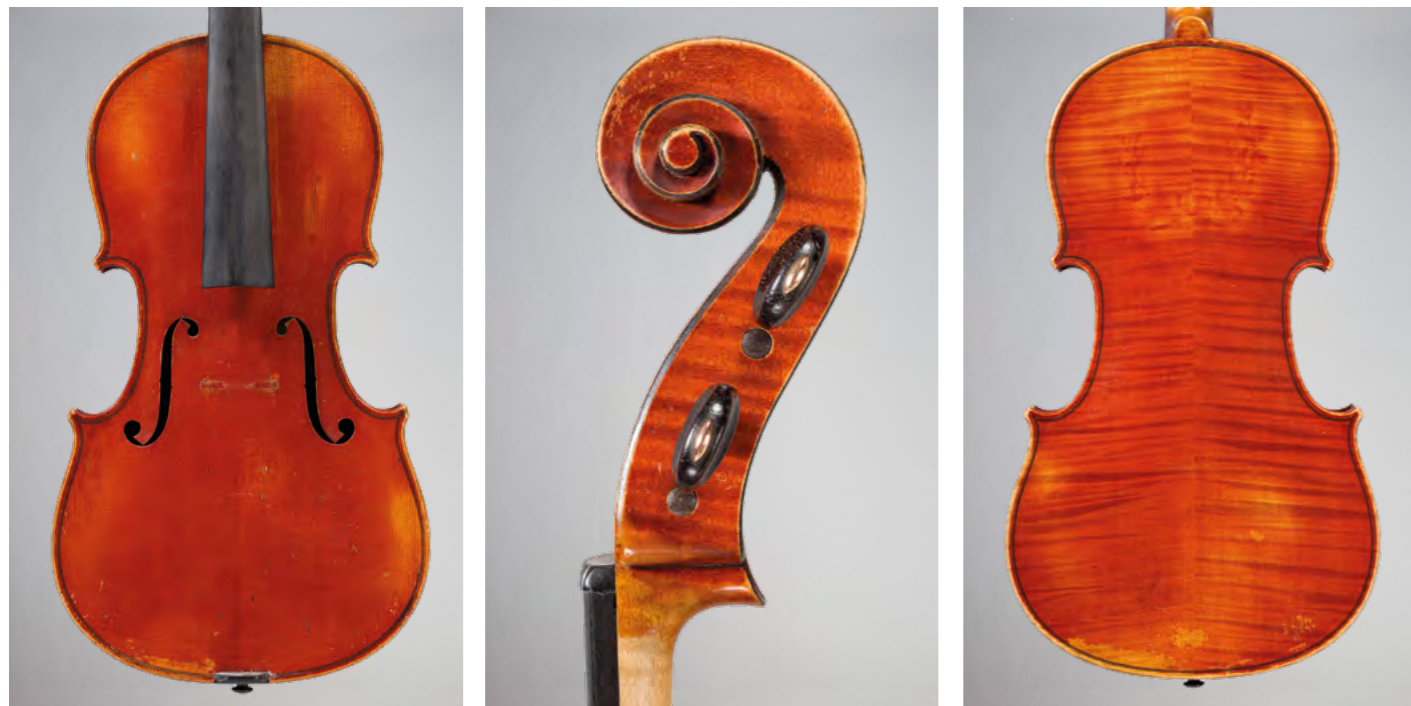
No. 322 Viola by CARESSA et FRANÇAIS Made in Paris around 1905/1910, bearing brands. 401mm.