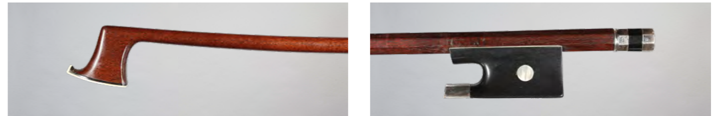
No. 47 Violin bow by Nicolas MALINE Made around 1855, stamped "Maline", silver mounted. 48g5, without hair or wrapping. Good condition.