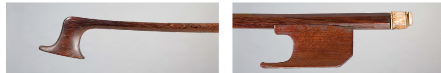
No. 180 Very handsome violin bow by Nicolas Léonard and François-Xavier TOURTE Made around 1780/1785, unstamped, ivory button. L. 70.2cm. 42g3, without hair or wrapping. Good condition.