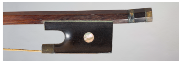
No. 298 Violin bow by Nicolas Rémy MAIRE Made around 1840/1845, nickel silver mounted. 55g2, thin hair and no wrapping. Fair condition.