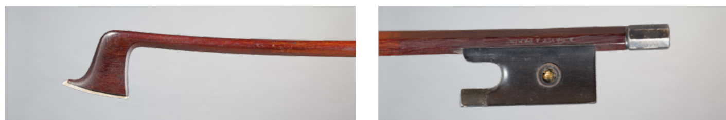
No. 130 Violin bow by Joseph Alfred LAMY Made around 1900, stamped "A. Lamy à Paris", silver mounted, 53g5, without hair or wrapping. Good condition.