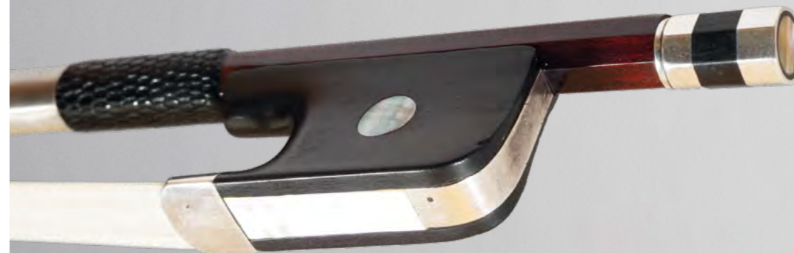
No. 200 Exceptional cello bow by François-Xavier TOURTE Made around 1820. Frog from another bow by this master and later button, silver mounted. L. 69.8cm. 78g7. Good condition.