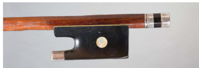
No. 300 Rare violin bow by Jacob EURY Made around 1840, stamped "Eury", silver mounted. 46g9, without hair or wrapping. Good condition.