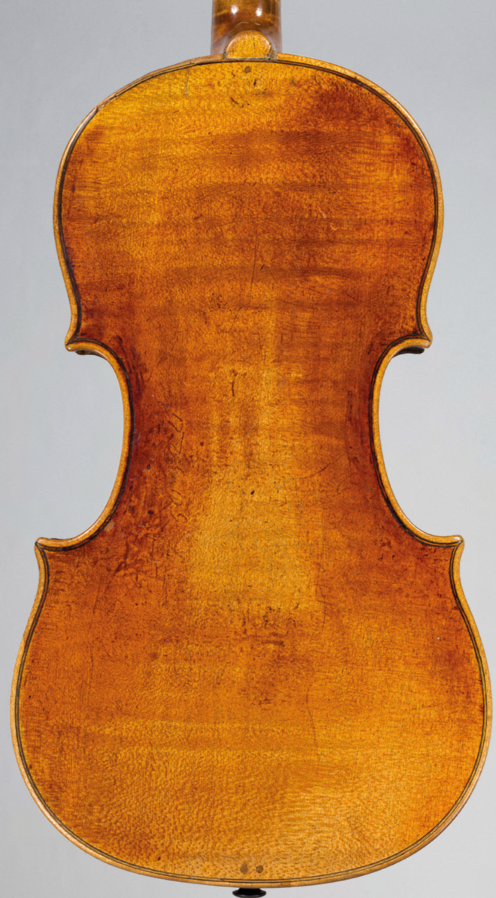
No. 160 Violin by Giovanni Battista GUADAGNINI Made in Piacenza around 1743/1745, labelled Simoutre. Front, head and right lower rib are 19 th century replacements. Various restorations on the front, including to a soundpost crack, raised ribs. 354mm.