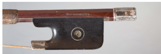
No. 330 Cello bow by Emile Auguste OUCHARD Made around 1937, stamped "E.A. Ouchard.Fils", silver mounted. 76g6, thin hair and light wrapping. Good condition.