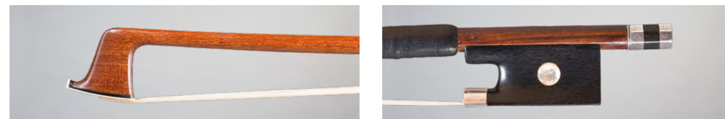
No. 250 Rare violin bow stick by François-Xavier TOURTE Made around 1825, unstamped, later reproduction frog and button made especially for the stick, silver. 55g3. Good condition.