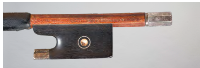
No. 400 Violin bow by Eugène Nicolas SARTORY Made around 1940, stamped, silver mounted, later button. 57g7, without hair. Good condition.