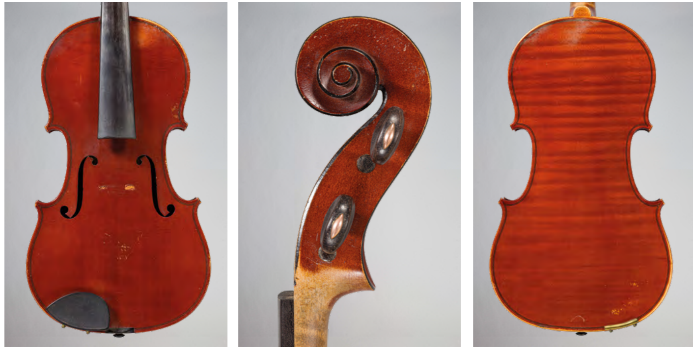
No. 315 Violin by Gustave BERNARDEL, made in Paris in 1901, number 1943, labelled Gustave Bernardel luthier du Conservatoire de Musique No. 1943, Paris 1901 and branded Gustave Bernardel. 360mm.