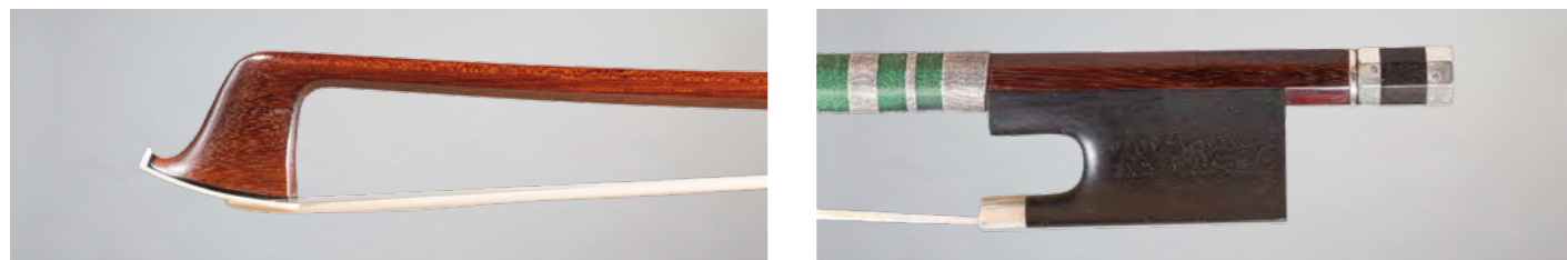
No. 100 Rare violin bow stick by François-Xavier TOURTE, Made around 1810, with a reproduction of the frog and button made especially for this stick by Sylvain BIGOT, silver mounted. 56g1, with hair and light wrapping. Good condition.