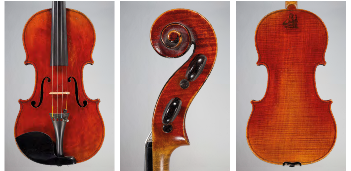
No. 10 Violin by Nicolas VUILLAUME, Sainte-Cécile-des-Thernes model Made in Mirecourt in 1846, labelled Ste-Cécile-des-Thernes Paris 1846 n°426, and bearing the Sainte-Cécile-des-Thernes logo. 357mm.