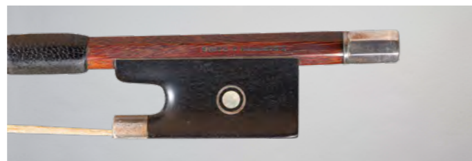
No. 350 Beautiful violin bow by Eugène Nicolas SARTORY Made around 1935, stamped "E. Sartory à Paris", silver-mounted. 58g8. Good condition.