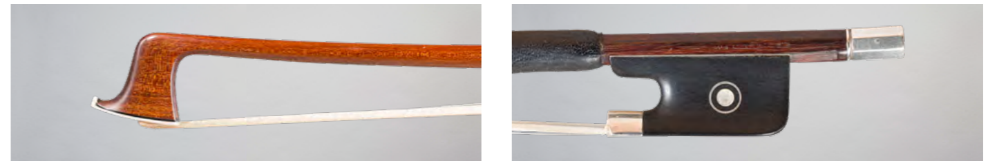
No. 90 Violin bow by Emile Auguste OUCHARD Made around 1937/1940, stamped "E.A. Ouchard.Fils", silver mounted. 60g. Good condition.