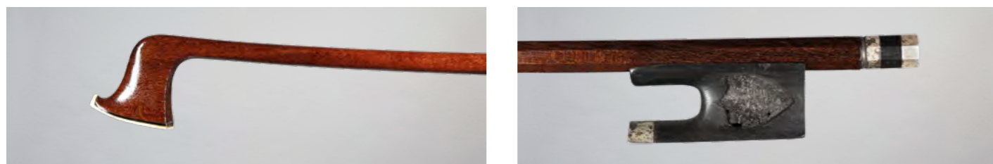
No. 128 Very handsome violin bow by Nicolas Léonard TOURTE Made around 1800, with later button, silver mounted. 46g4, without hair or wrapping. Good condition.