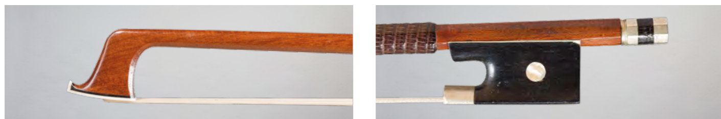
No. 140 Violin bow by Nicolas MALINE Made around 1865/1870, unstamped, nickel silver mounted. 60g8. Good condition.