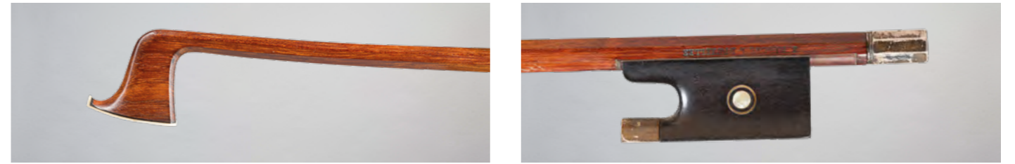
No. 30 Handsome violin bow by Eugène Nicolas SARTORY Made around 1895, stamped "H.Darche à Bruxelles", silver mounted. 52g, without hair or wrapping. Good condition.