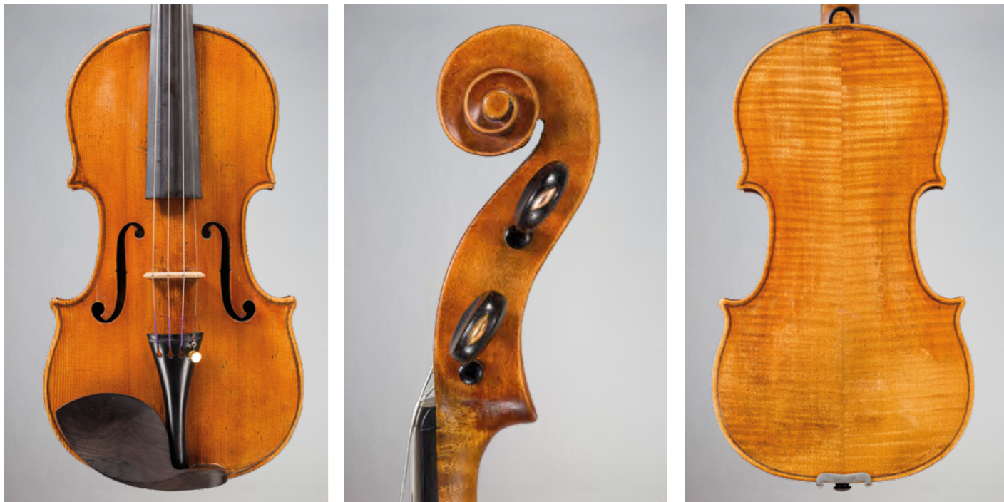
No. 175 Small viola by Giuseppe GAGLIANO converted into a violin Made in Naples around 1775/1780, labelled Ferdinandus Gagliano. 358mm.