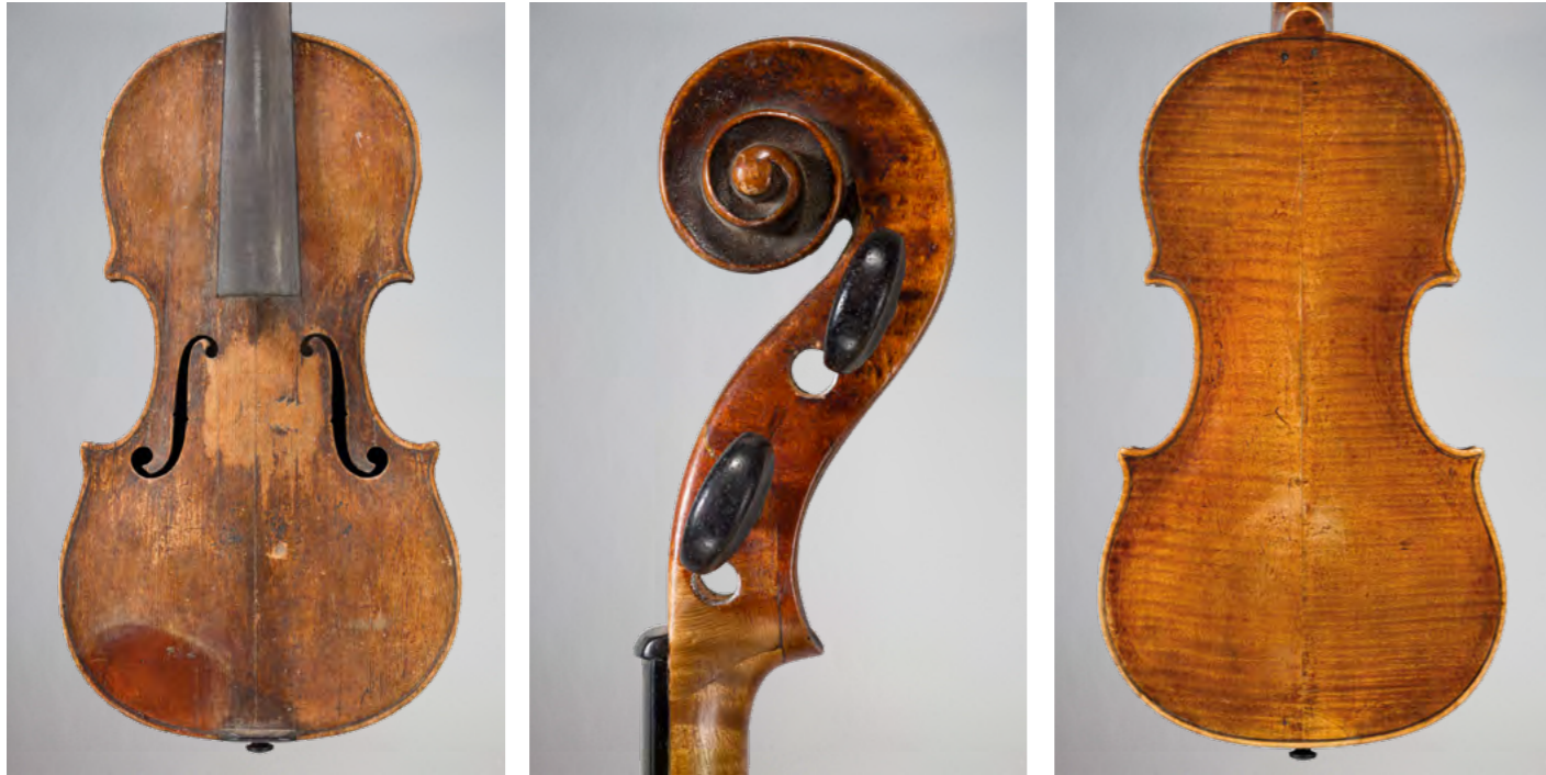
No. 75 Violin by Gioffredo CAPPA , made in Saluzzo around 1700. Various cracks and restorations, including a soundpost crack repair with several non-original parts. 353mm.