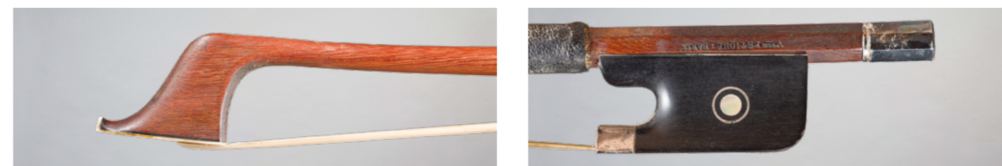
No. 280 Cello bow by Victor François FÉTIQUE Made around 1925, stamped "Vtor Fetique à Paris", silver mounted. 81g5. Good condition.