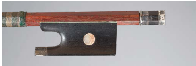
No. 200 Magnificent violin bow by Georges-Frédéric SCHWARTZ, made around 1830/1835 Silver mounted. 47.7g, without hair and with remnants of light wrapping that appears to be original. Good condition.