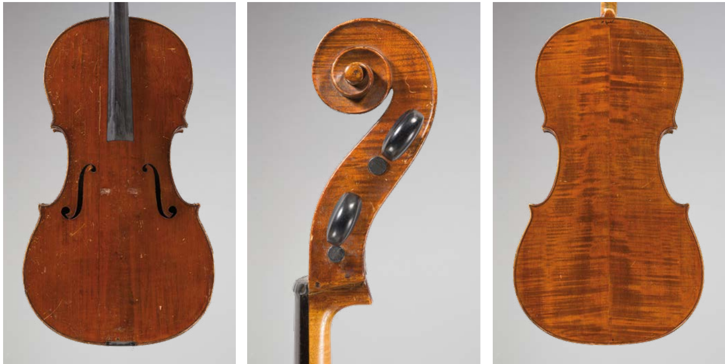
No. 110 Cello by Alcide GAVATELLI Made in Buenos Aires in 1925, bearing the label "Alcide Gavatelli Luthier B. Aires Talcahuano 648", stamp and signature. 756mm.