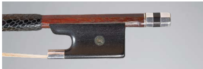
No. 250 Violin bow by Charles François PECCATTE Made around 1865/1870, stamped «J.B. Vuillaume», silver mounted. 56.1g. Good condition.