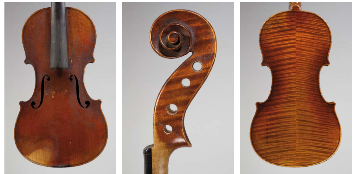
No. 212 Interesting violin by Alexandre DELANOY, made in Bordeaux in 1881, bearing the label «Alexandre Delanoy, rue Voltaire, Bordeaux 1881» and the signature «A. Delanoy Bordeaux 1881 26 Novembre». 357mm.