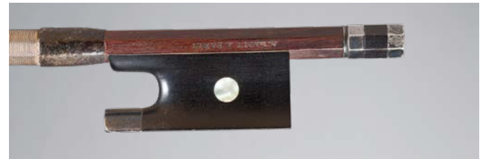
No. 330 Magnificent violin bow by Joseph Alfred LAMY (Father) Made around 1885/1890, stamped «A. Lamy Paris», silver mounted. 53.6g, without hair and with original wrapping. Very good condition.