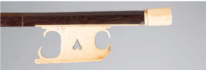
No. 30 Rare violin bow by Jacques TAINURIÉ Made around 1770/1775, stamped «Tainturié», later button, ivory mounted. 49.9g, without hair or wrapping. Very good condition.