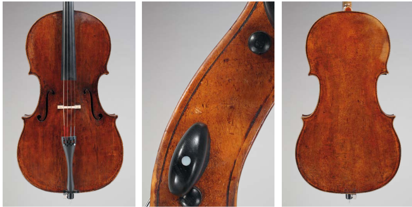
No. 125 Cello by Alessandro GAGLIANO Made in Naples around 1715, bearing a facsimile Grancino label. 751mm.