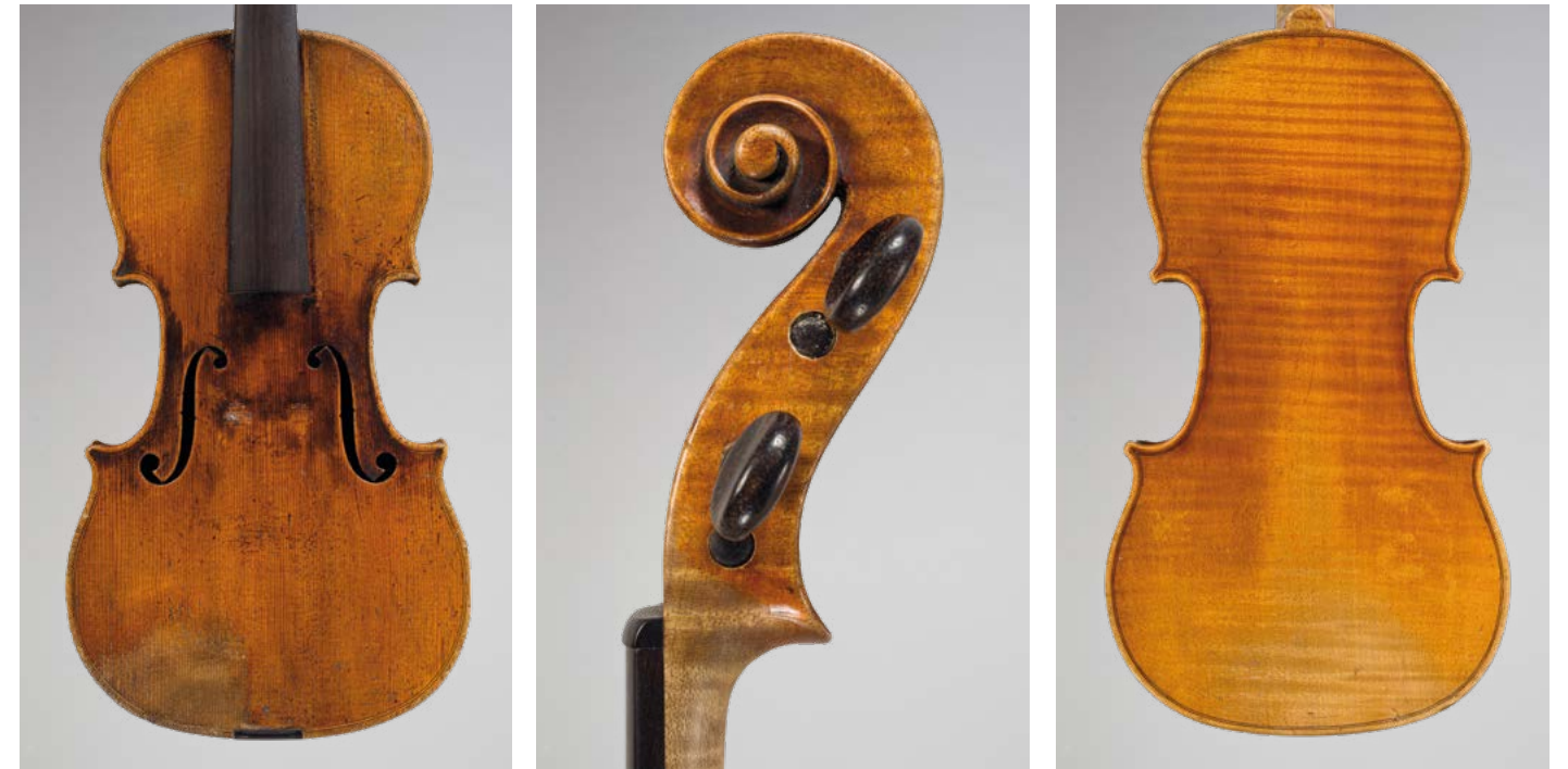
No. 61 Violin by Charles JACQUOT Made in Paris around 1860, bearing the label «Charles Jacquot Paris 48 rue de l'Echiquier» and a stamp. 362mm.