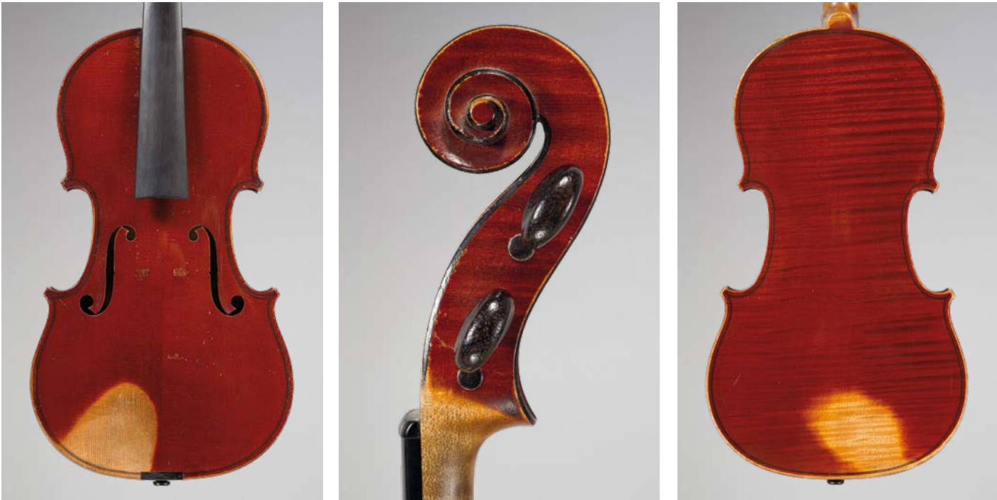
No. 9 Violin by GAND et BERNARDEL, made in Paris in 1887, numbered 1292 Bearing the label «Gand et Bernardel luthiers du conservatoire de musique No. 1292 Paris 1887» and stamped. 358mm.