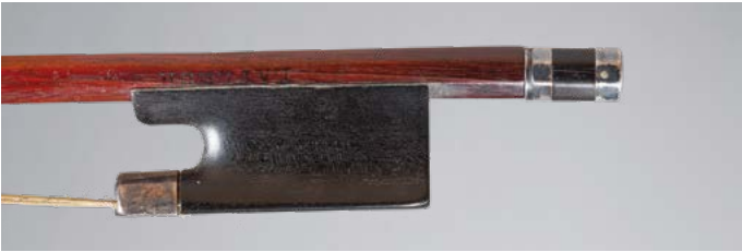
No. 50 Rare violin bow by Joseph René LAFLEUR Made around 1840/1845, stamped «Lafleur», silver mounted. 53.8g, with thin hair and without wrapping. Good condition.