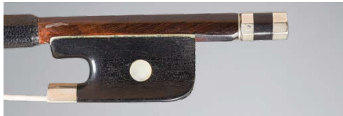
No. 240 Beautiful cello bow by Nicolas Rémy MAIRE Made around 1845, nickel silver mounted. 81.5g. Good condition.