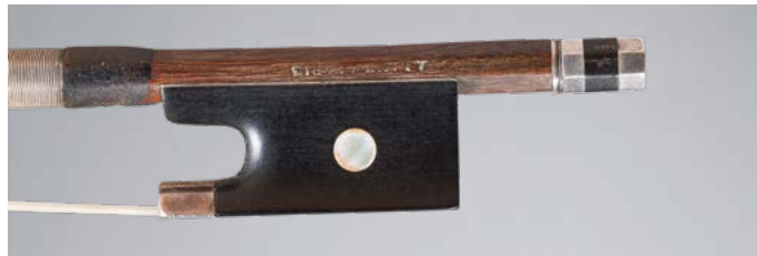
No. 230 Very beautiful violin bow by Joseph Alfred LAMY (Father), made around 1888, stamped «A Lamy Paris» Silver mounted. 54.1g, with thin hair and light wrapping. Good condition. Sold with the corresponding original invoice.