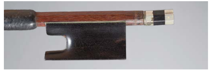
No. 300 Beautiful violin bow by Nicolas Rémy MAIRE Made around 1850, nickel silver mounted. 47g, without hair. Good condition.