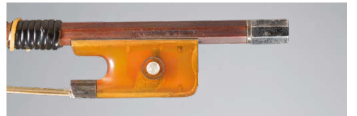
No. 400 Magnificent violin bow by Emile Auguste OUCHARD (Fils), made around 1925/1930, stamped «Emile Ouchard» Tortoiseshell frog, silver mounted. 60.8g. Good condition. Instrument sold in collaboration with the auction house Limoges Enchères.