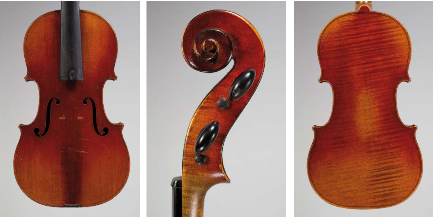
No. 10 Fine violin by Nicolas VUILLAUME Made in Mirecourt around 1850, bearing label and stamp. 360mm.