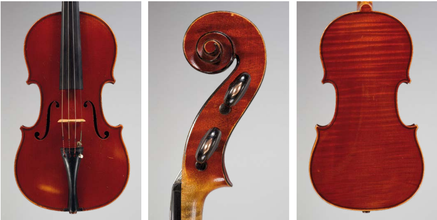
No. 220 Fine violin by CARESSA et FRANÇAIS, made in Paris in 1905, numbered 160, Bearing the label «Caressa et Français luthiers du Conservatoire de Musique No. 160 Paris 1905» and stamps. 358mm.