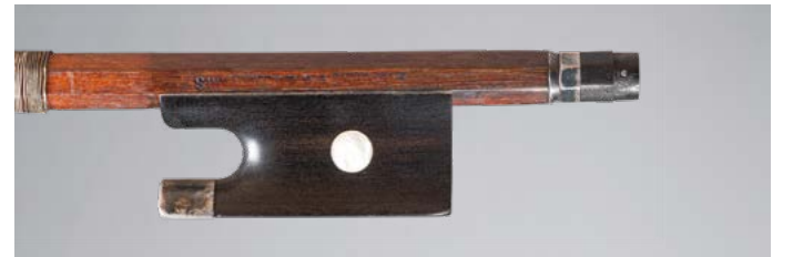
No. 350 Very fine violin bow by Eugène Nicolas SARTORY Made around 1895, stamped «A.Michel.6.R.Gaillon Paris», silver-mounted. 48.7g, without hair and with light wrapping. Good condition.