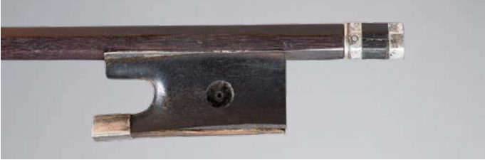
No. 150 Very fine violin bow by François PECCATTE, made around 1842/1845 Stamped «Peccatte» on the side facing the audience, silver mounted. 52.9g, without hair or wrapping. Good condition.