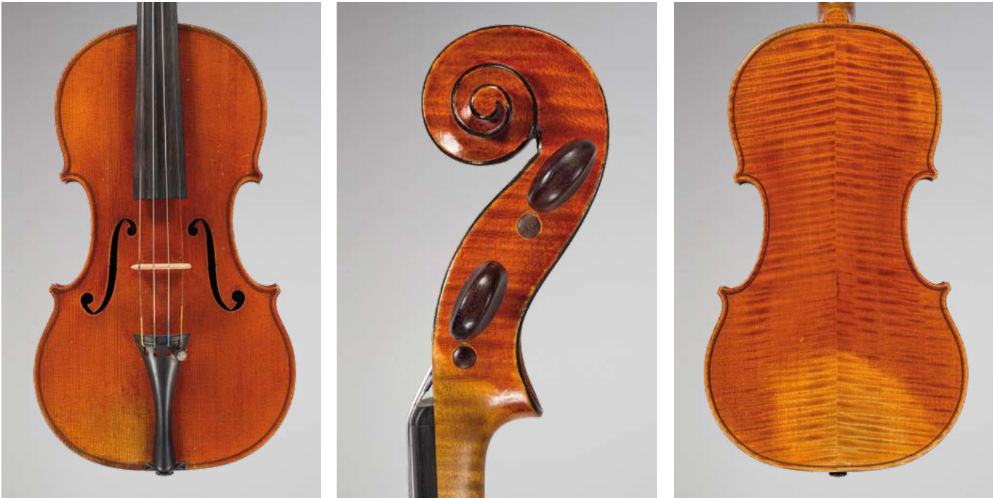
No. 75 Violin by Jean-Baptiste VUILLAUME, made in Paris in 1871, numbered 2870 Guarnerius Del Gesu model, bearing label and stamp. 357 mm. Instrument sold in collaboration with the auction house Touati Duffaud.