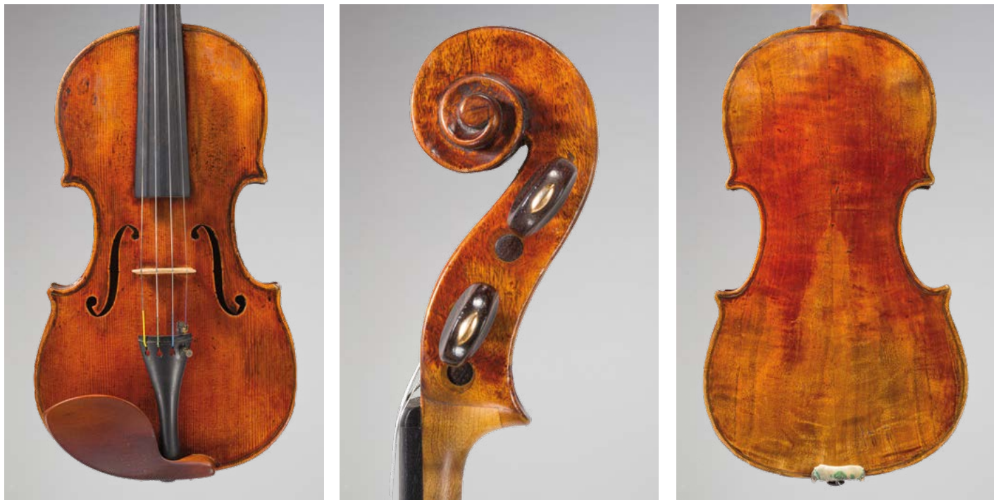
No. 160 Interesting violin by Stefano SCARAMPELLA Made in Mantua around 1900/1905, bearing the label «Scarampella», back and head of poplar. Bassbar crack. 356mm.