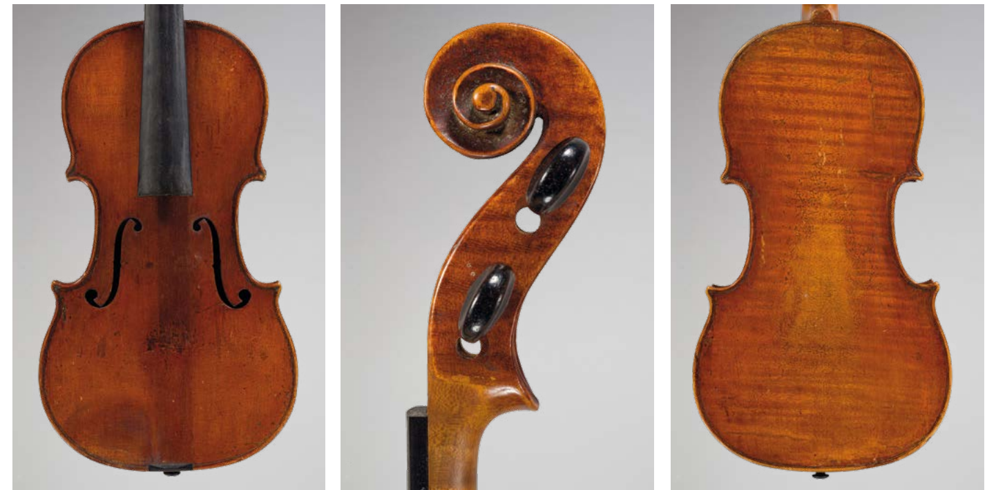
No. 153 Violin by Tommaso BALESTRIERI Made in Mantua around 1760, ribs and head replaced. Small soundpost crack on the back. 351mm.