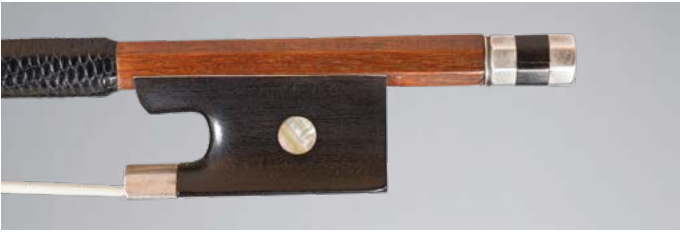
No. 80 Very fine violin bow by Nicolas MALINE, made around 1865/1870, silver mounted. 61.5g, with thin hair and light wrapping. Very good condition. Featured in the book L'Archet, volume II, page 290, no. 16.