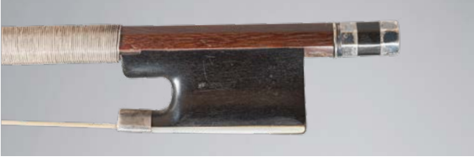
No. 140 Fine violin bow by Nicolas Rémy MAIRE, Made around 1855/1860, patented model with interchangeable hair, stamped «Vuillaume à Paris», silver mounted. 58.1g. Good condition. Bow sold in collaboration with the auction house Touati Duffaud.