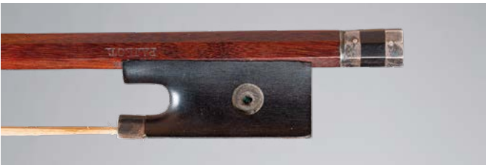
No. 100 Very fine violin bow by Etienne PAJEOT Made around 1815, stamped «Pajeot,» silver mounted. 52.1g, with thin hair and no wrapping. Very good condition.