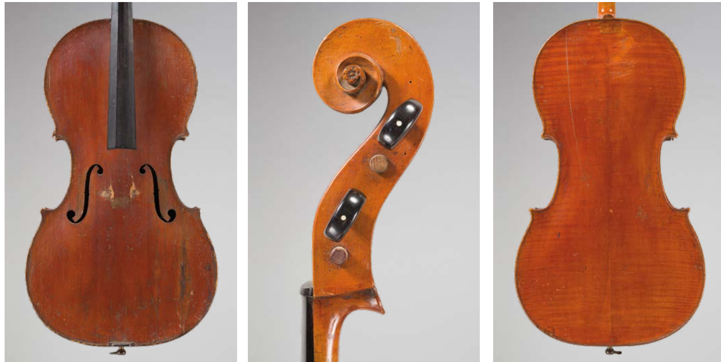
No. 122 Cello by Georges COUSINEAU, made in Paris in 1761 Labelled «A la Victoire Cousineau Ouvrard 1761 Paris». Restored f-holes, heel replaced, cracks on the ribs. 750mm.