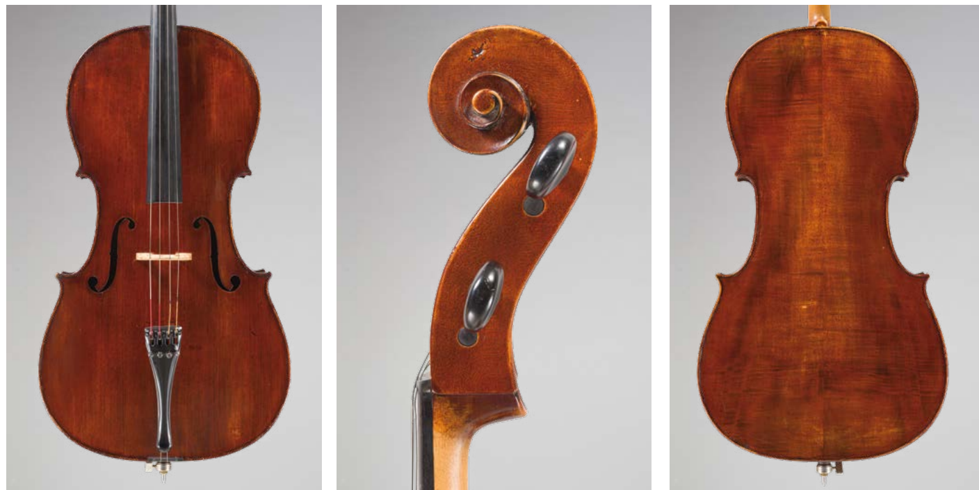
No. 123 Cello by RENAULT et CHATELAIN Made in Paris in 1780, labelled «Renault et Chatelain Rue de Braque, coin de la Rue Saint Avoye Paris 17...» and stamped. 745mm.