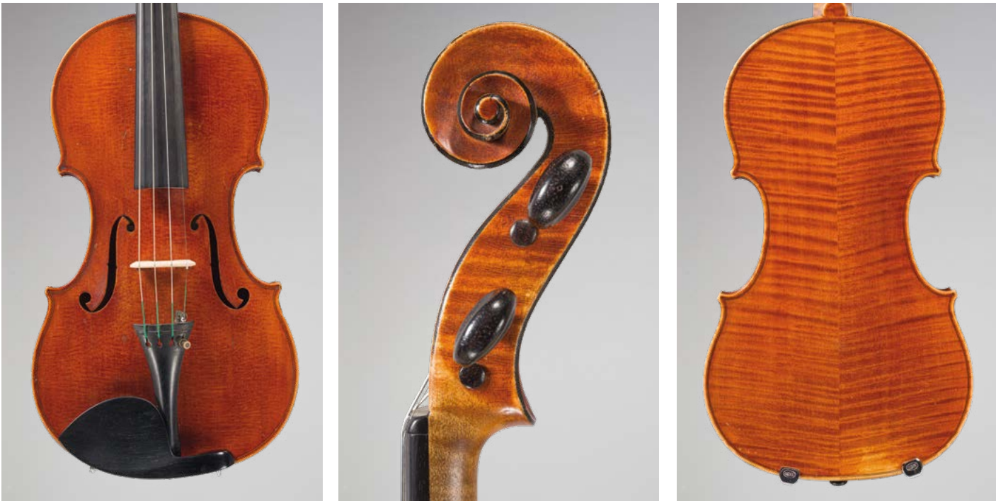
No. 25 Fine violin by Hippolyte Chrétien SILVESTRE Made in Lyon in 1885, numbered 209, bearing the label «H.C. Silvestre Neveu a Paris en 1885 No. 209» and stamped. 355mm.