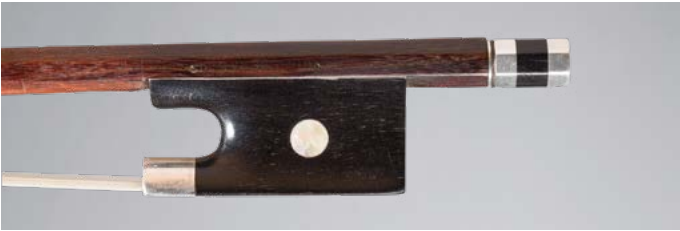
No. 40 Very fine violin bow stick by Nicolas Rémy MAIRE, made around 1860 Stamped «Vuillaume à Paris», later replica button and frog, silver mounted. 57.2g, without wrapping. Good condition.